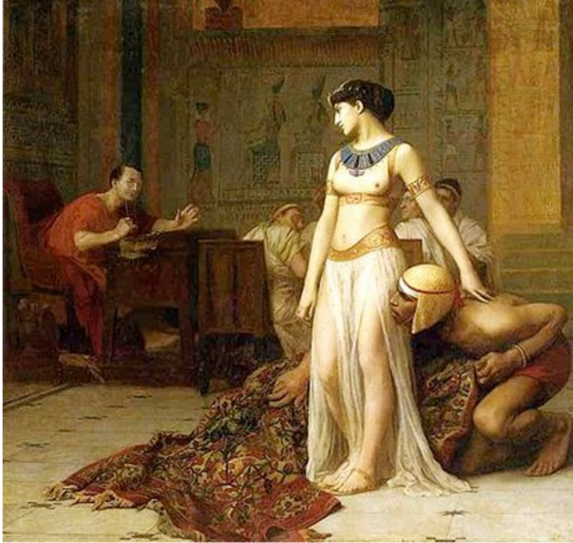
Cleopatra and Caesar (1866). Painting by Jean-Léon Gérôme.

Though Egyptian women may have been liberated, in Ptolemaic Egypt, queens still needed a male co-regent. Cleopatra's options were limited. Her choices were her ten-year-old brother, or her even younger brother.