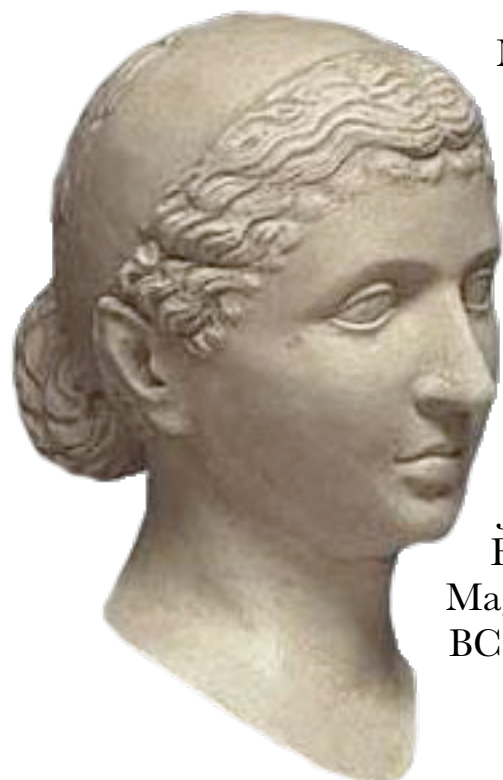
Bust of Cleopatra, Antiken Museum, Berlin. 35 B.C.

Married in name only, Cleopatra ruled as the sole monarch with Ptolemy XIII, as consort for the close to two years after which time he and his counsels had her ousted. Just as she was amassing an army in Syria to take back the throne, a Civil War ensued between Julius Caesar (100 BCE-44 BCE) and Gnaeus Pompeius Magnus or Pompey (106 BCE-48 BCE).