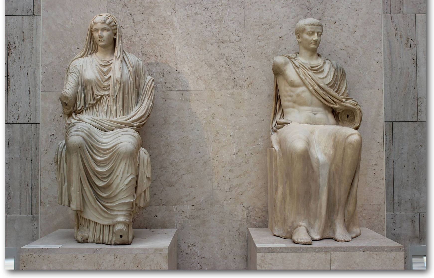
Tiberius and his mother Livia, AD 14-19, from Paestum, National Archaeological Museum of Spain, Madrid

"HOWEVER, THE PATTERN IS VEXING. THE FOUR